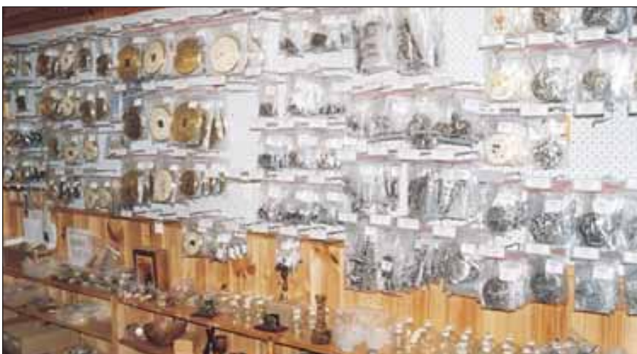
Photo.3: Clock fit-ups, hygrometers, pewter fittings, glass lampshades and tealight candle votives

All tools and supplies had to be purchased from Melbourne, a problem faced